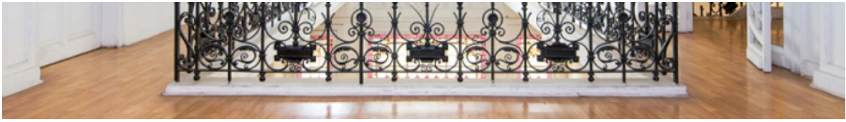
Headquarters of the Colegio de Arquitectos de Chile, Santiago