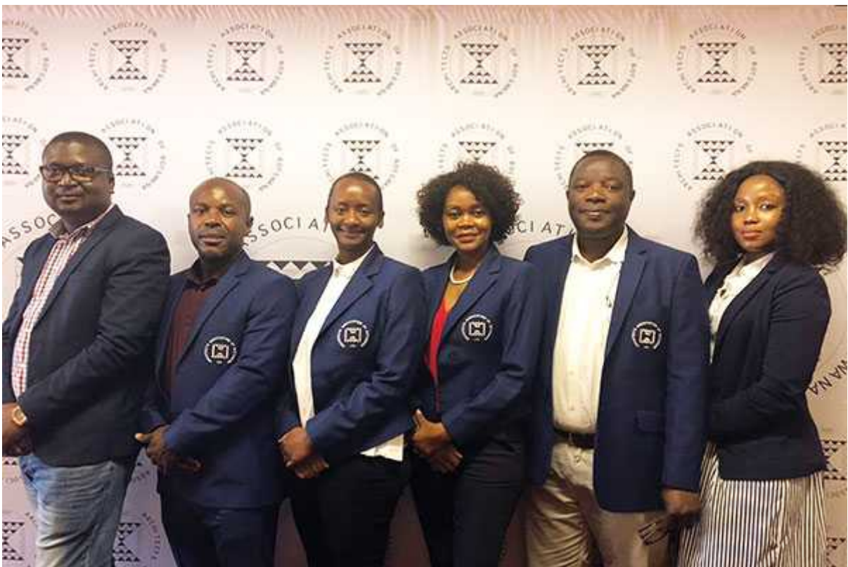
AAB Executive Committee