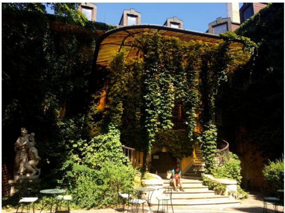
Headquarters of the Association of Hungarian Architects, Budapest