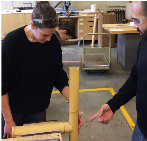
Student-led workshops: Rammed Earth (left) and Bamboo (right) from Traditional Building Methods: New Adaptations at University of Washington - Seattle.

The Jury further identified 3 entries to be commended for their inspiring proposals that successfully bridge gaps between architects and communities and between various built environment disciplines: