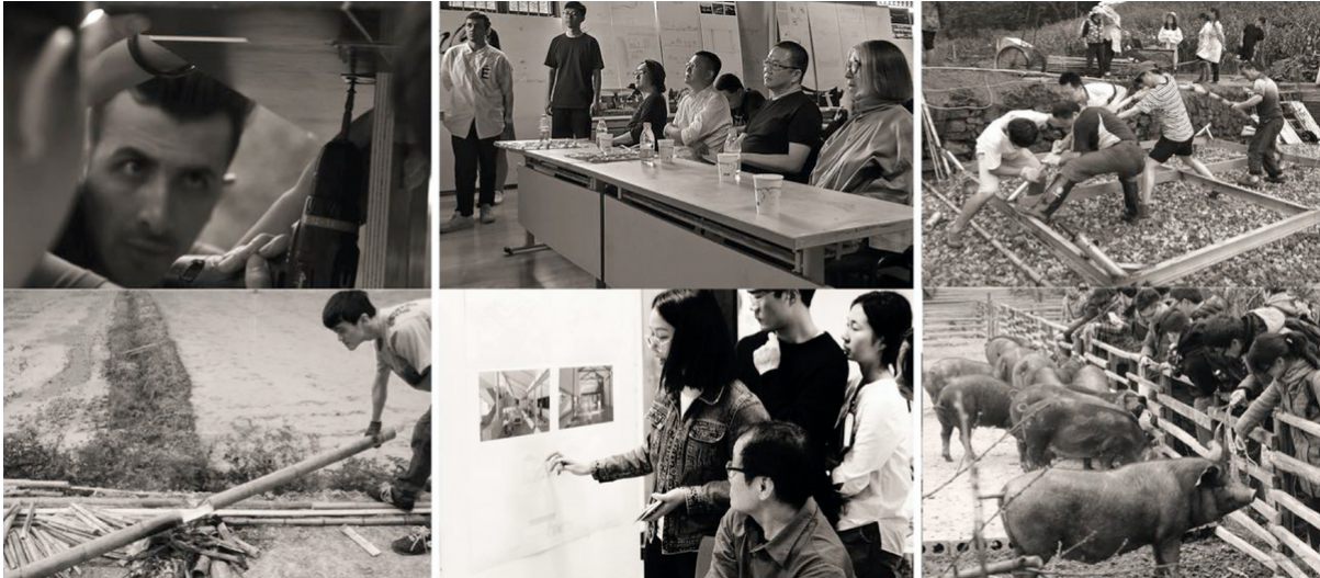
"External Craftsmanship Masters", "International Collaboration," & "Public Participation" from Living Construction in Rural Communities at School of Architecture, Southeast University.