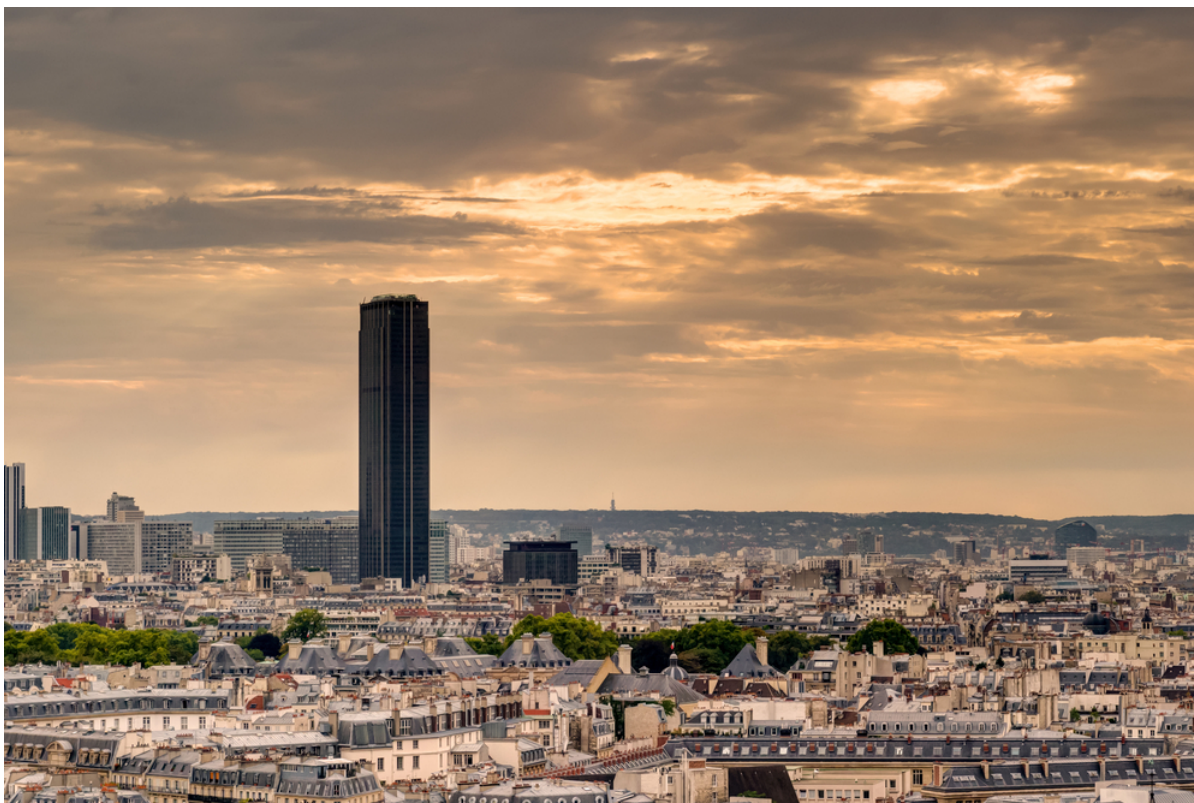
The Maine-Montparnasse Tour in Paris, France, Headquarters of the UIA Secretariat