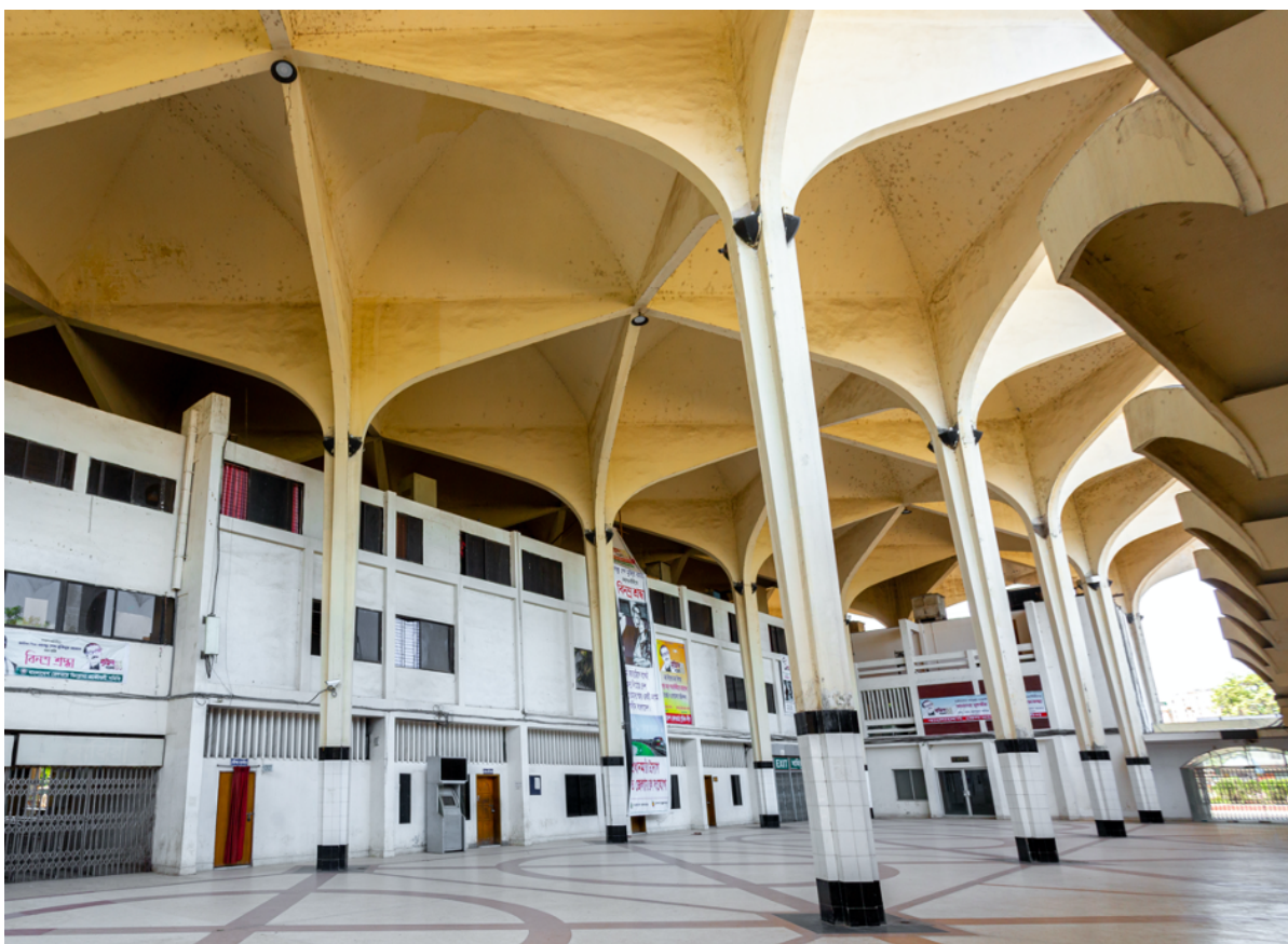
The Kamalapur Railway Station in Dhaka, Bangladesh