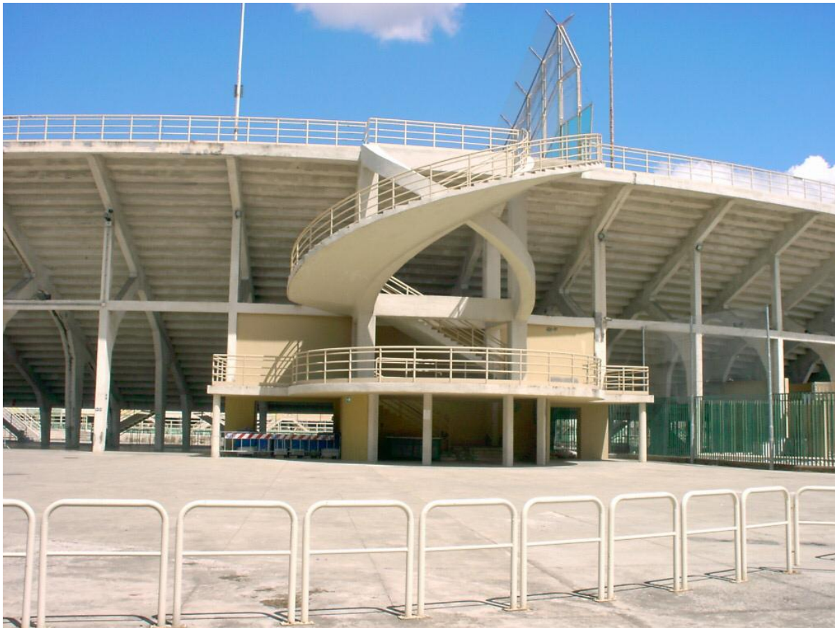
The Stadio Artemio Franchi in Florence, Italy