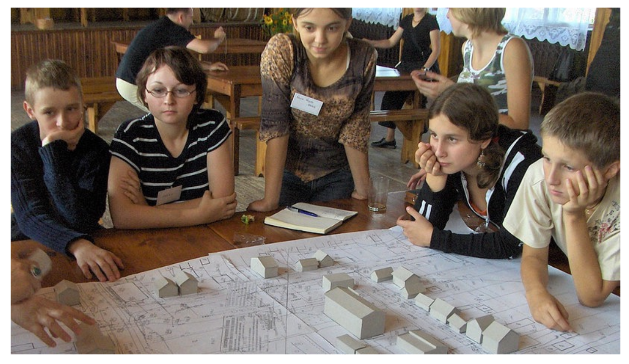
Architecture for Children workshop in Poland