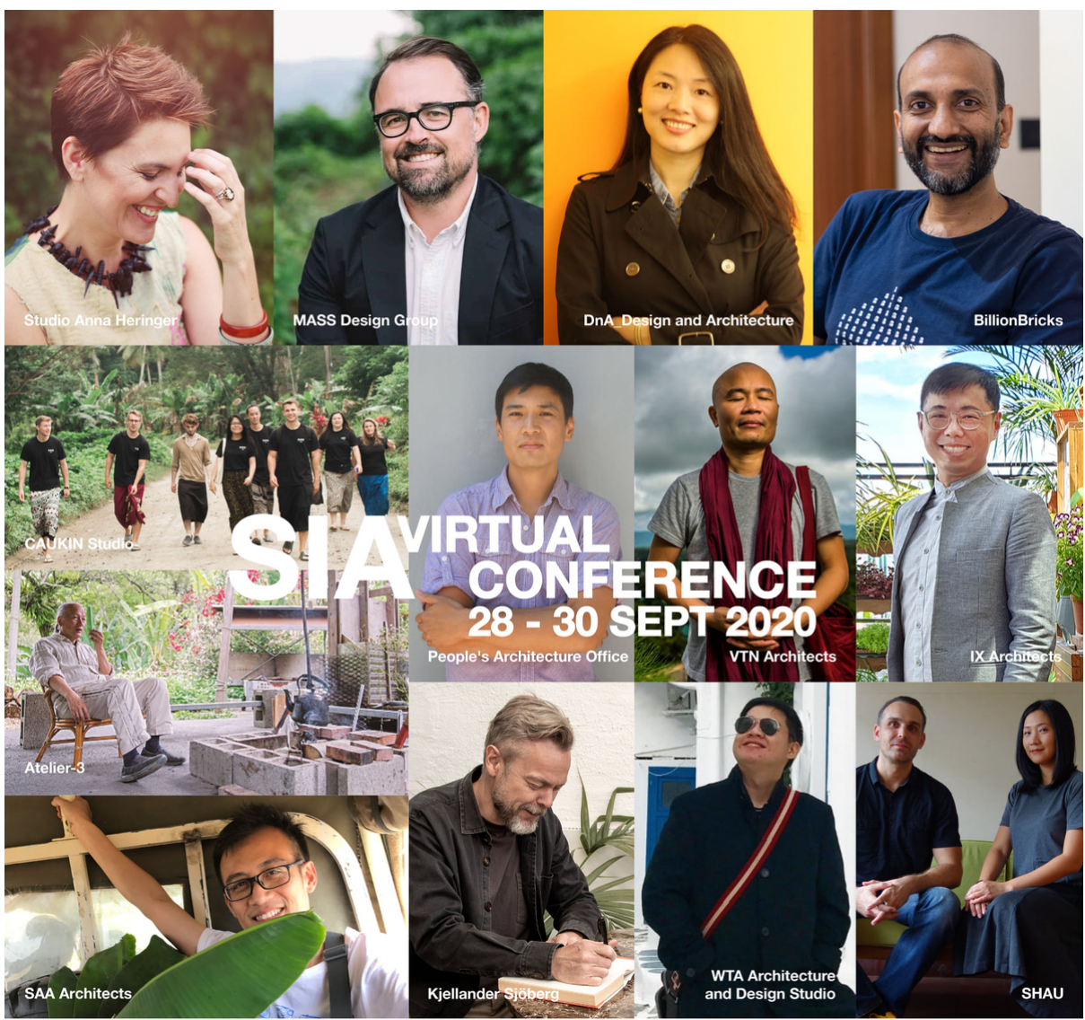
for full programme and sign up https://www.archifest.sg/conference