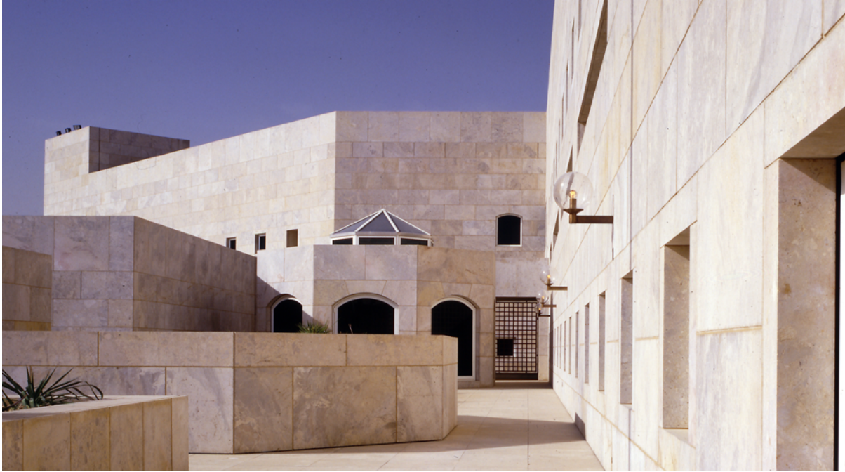
Ministry of Foreign Affairs, Riyadh, Saudi Arabia, architect Henning Larson (1984)