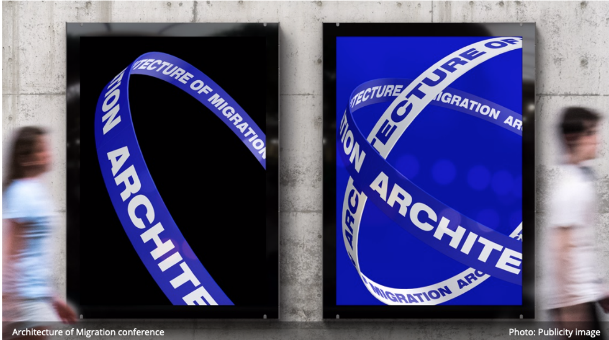
Architecture of Migration conference