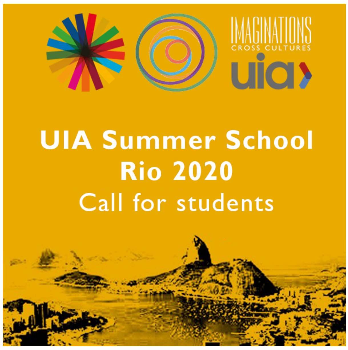
UIA WORLD CONGRESS: SUMMER SCHOOL

Architecture and urban planning students from all over the world are invited to submit their applications to the UIA 202020RIO Summer School. Students must be in their 2nd or 4th year of study. The Summer School will take place in Rio de Janeiro (Brazil) from 11 to 23 July 2020. Applications must be submitted by 2 December 2019.