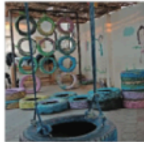
Baharwa school (Up-Cycling playground)