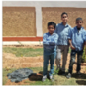
Grey Water Treatment workshop