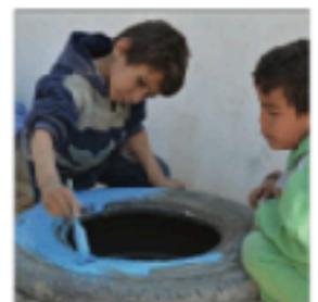
Up-Cycling playground workshop