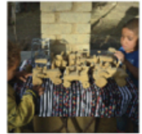
Clay and Natural Materials workshop