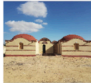
Prototype for interactive school building