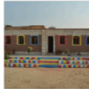
Behbeit school (Painting walls)