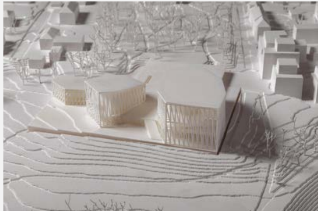
1st prize: Arquivio Architects (Spain)