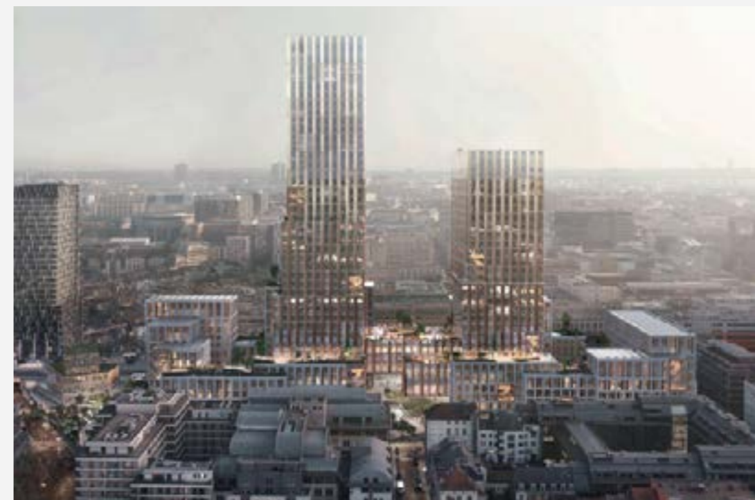
3rd prize: BURO II & ARCHI-I / B2Ai (Belgium), C.F. Møller Architects (Denmark), DELVA Landscape Architects (Netherlands) and VK Engineering (Belgium)