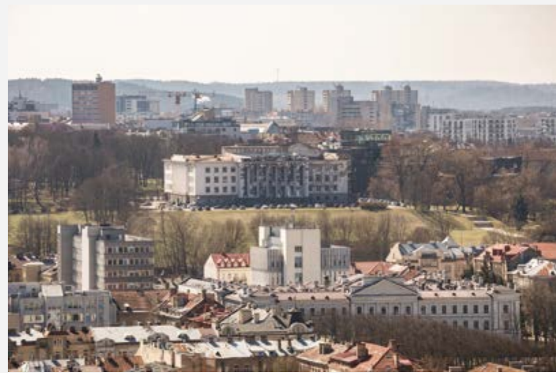
Photo of the site

More about the competition: https://bit.ly/ui-a-national-concert-hall