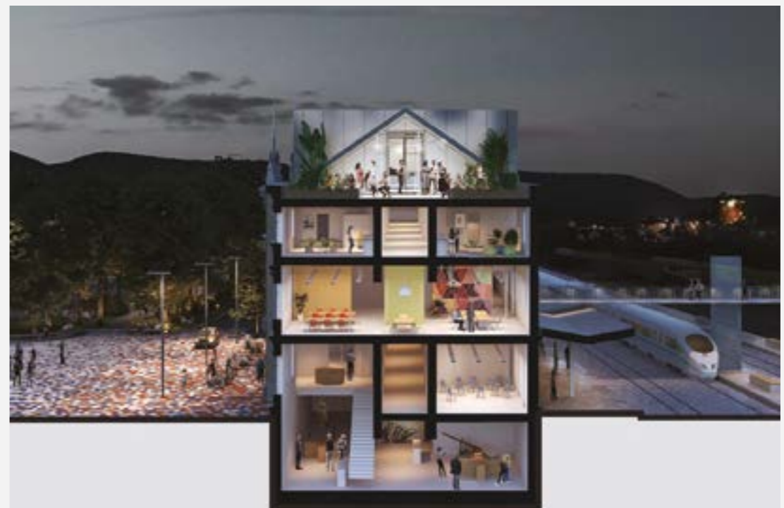
3rd prize: SADAR+VUGA d.o.o. (Slovenia)