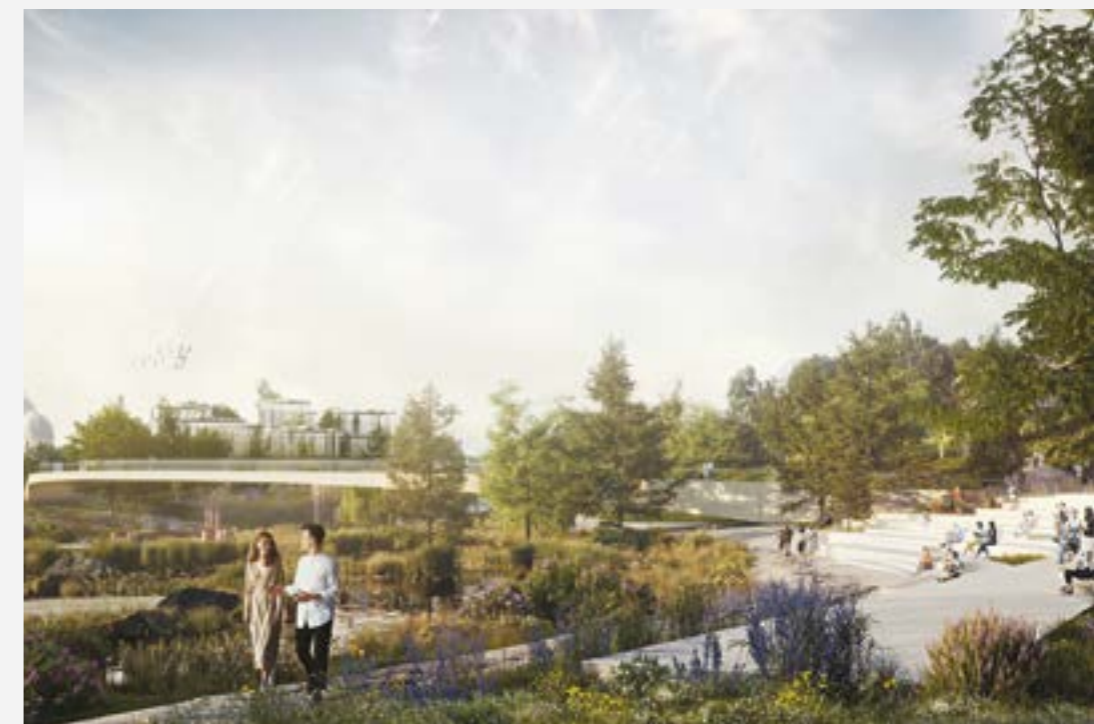
3rd prize: Hvoja (Russia) and KARAVAN landskapsarkitekter (Sweden)