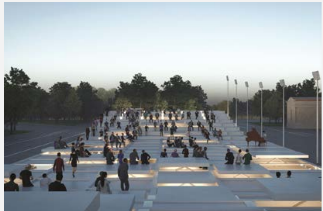
1st prize: Studio Associato di Architettura Baglivo Negrini (Italy)

More about the competition: https://bit.ly/uiia-piazza-transalpina