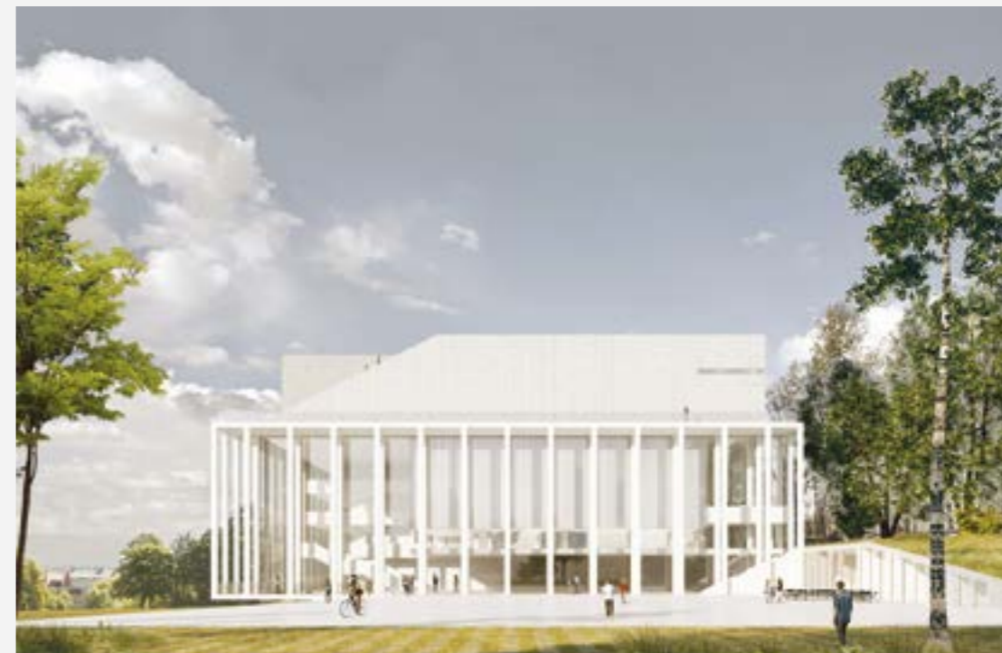
3rd prize: UAB PALEKO ARCHSTUDIJA (Lithuania)