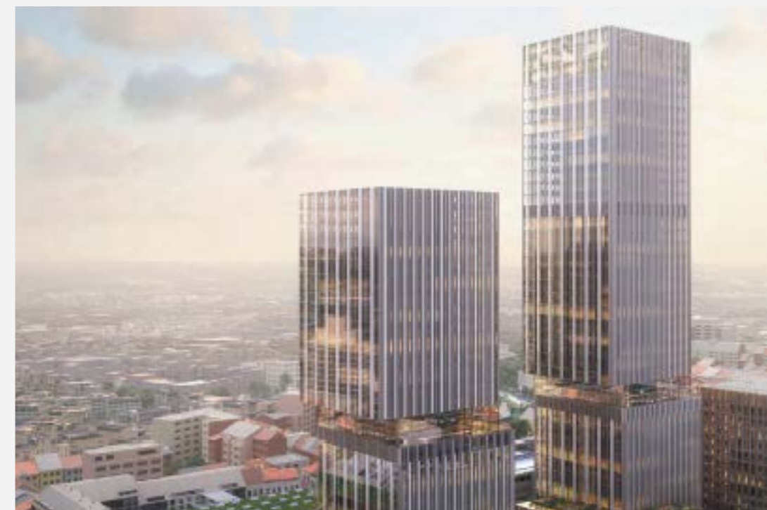
1st prize: Rafael de la-Hoz Arquitectos (Spain), Perkins+Will (UK), Latz + Partner Landscape Architecture Urban Planning (Germany), Tecnica y Proyectos (Spain) and MC2 Estudio de Ingeniería (Spain)

More about the competition: https://bit.ly/uia-en-loi-130