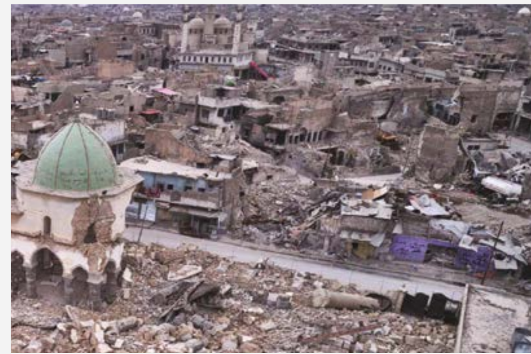
Aerial photo of the site