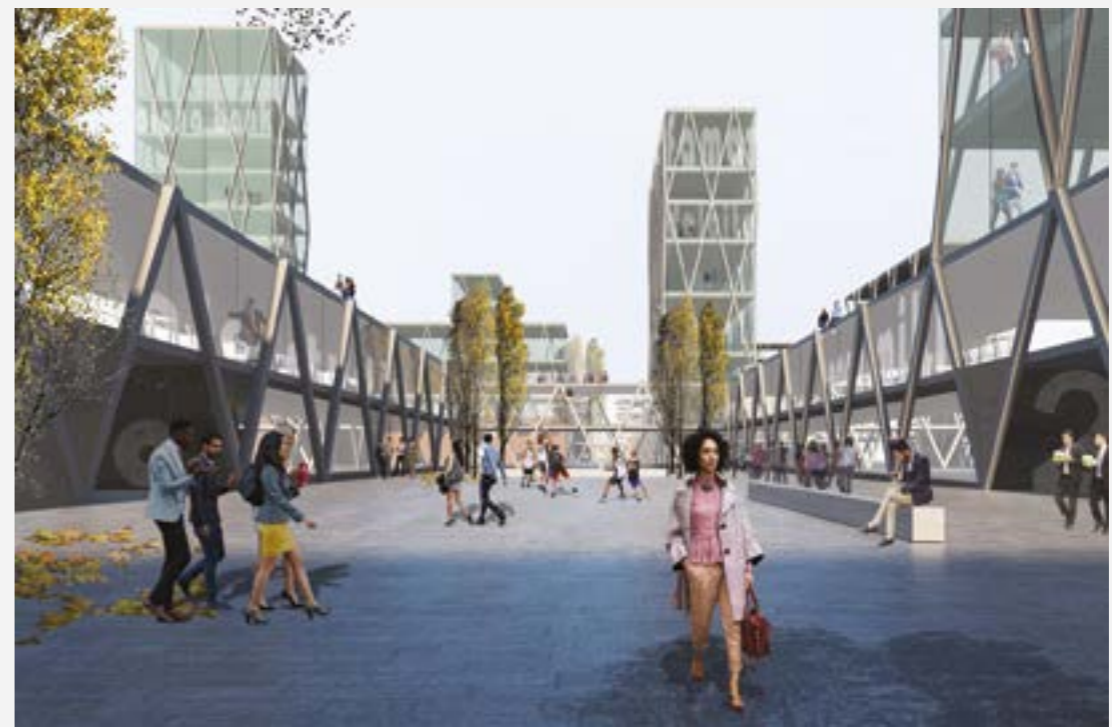
1st prize: ALE Studio (Spain)

More about the competition: https://bit.ly/uia-arxellence2