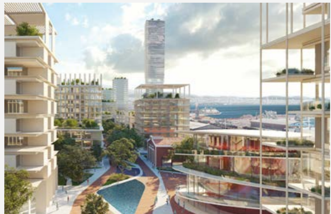
3rd prize: Mogan Architecture (Netherlands)