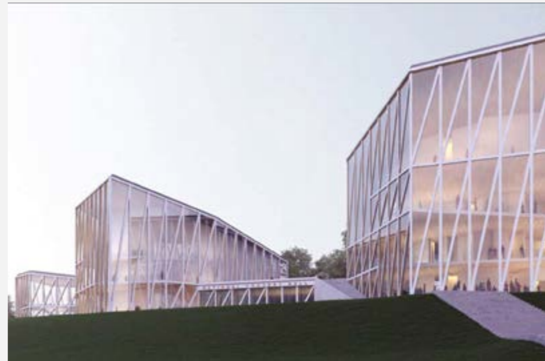
1st prize: Arquivio Architects (Spain)