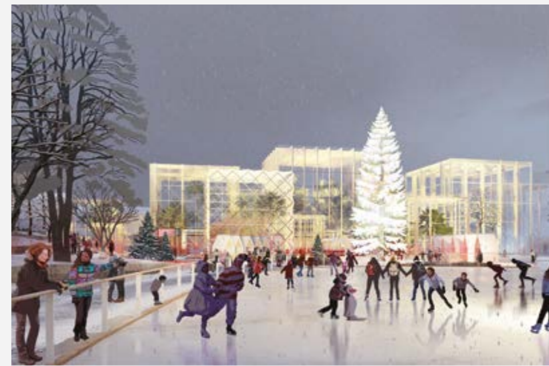
1st prize: Studio 44 (Russia) and WEST 8 (The Netherlands)