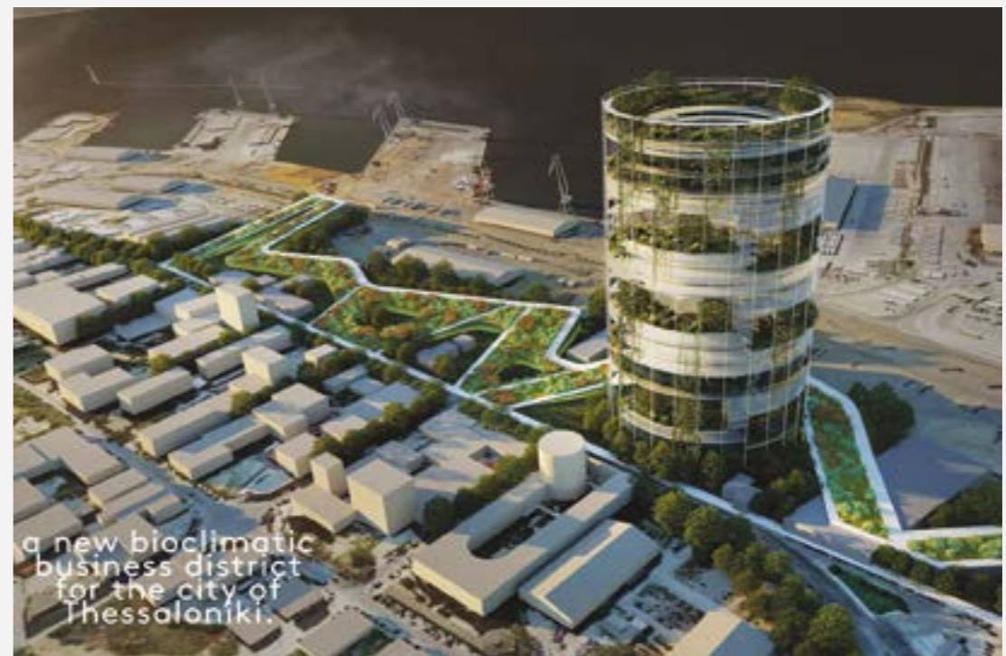
a new bioclimatic business district for the city of Thessaloniki.

More about the competition: https://bit.ly/uia-arxellence2