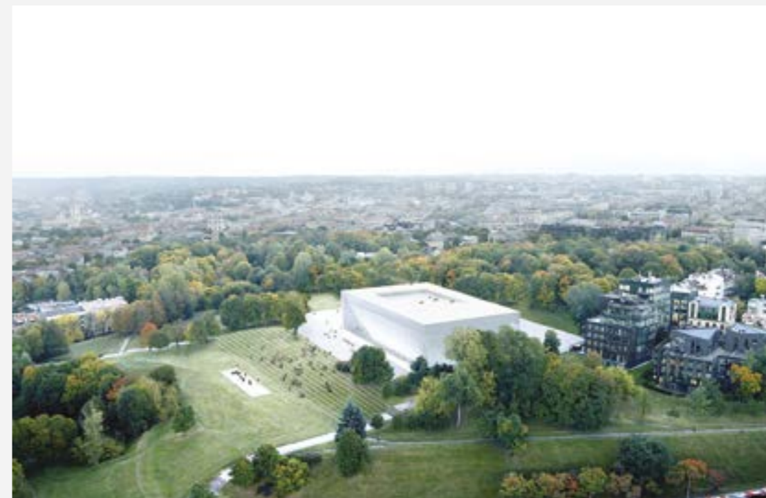
Honourable mention: Smar Architecture Studio, Australia.