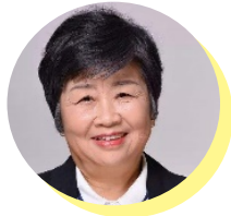
Prof. Tang Yu-yang , Mainland China

Day 3 - World Heritage Convention in UIA-Region 4