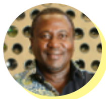
Prof. George Abungu, KENYA

Day 1 - International Bodies Round table discussions