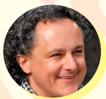
Prof. Leonardo Castriota, BRAZIL

Day 1 - Overview on World Heritage Convention