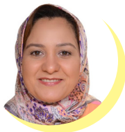
Prof. Heidi Shalaby, EGYPT

Day 2 - World Heritage Convention in UIA-Region 5