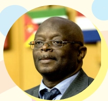
Dr Webber Ndoro, ZIMBABWE

Day 1 - Overview on World Heritage Convention