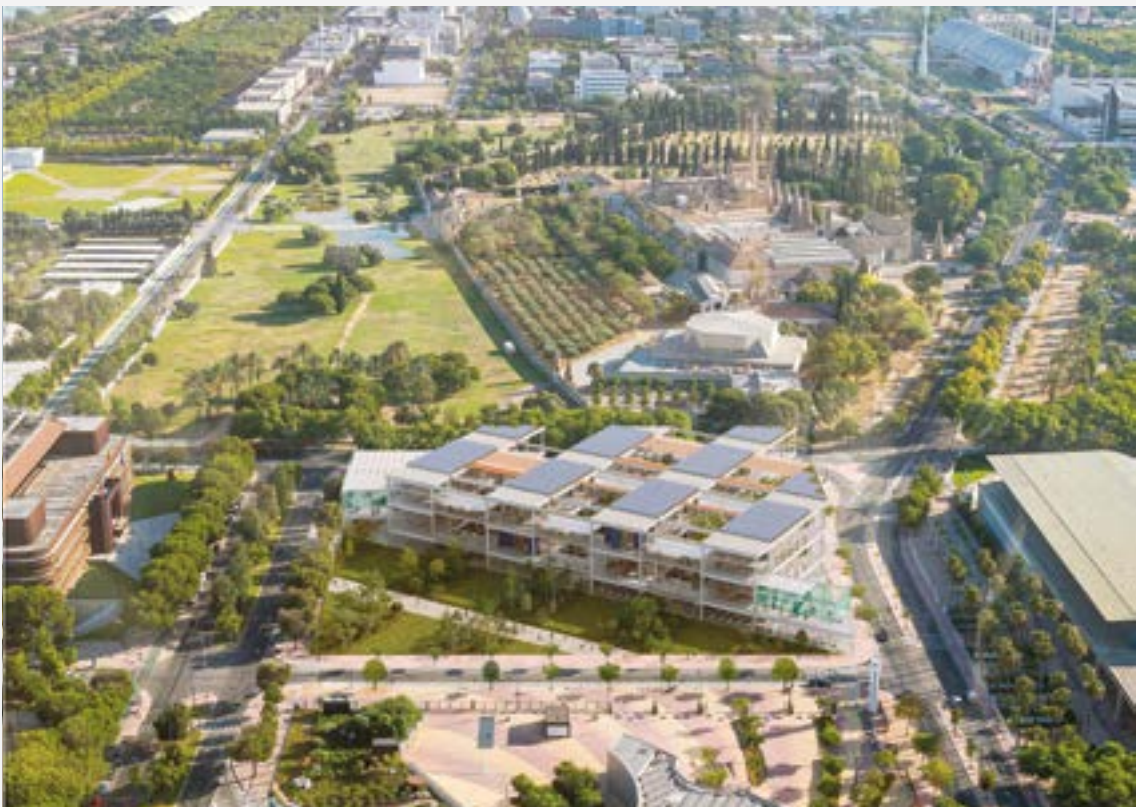
3rd Prize: Cobe (Denmark) with Esteyco (Spain), FSL Ingeniería y Diseño Sostenible (Spain), Estudi Ramon Folch i Associats (Spain) and b720 Arquitectura (Spain)