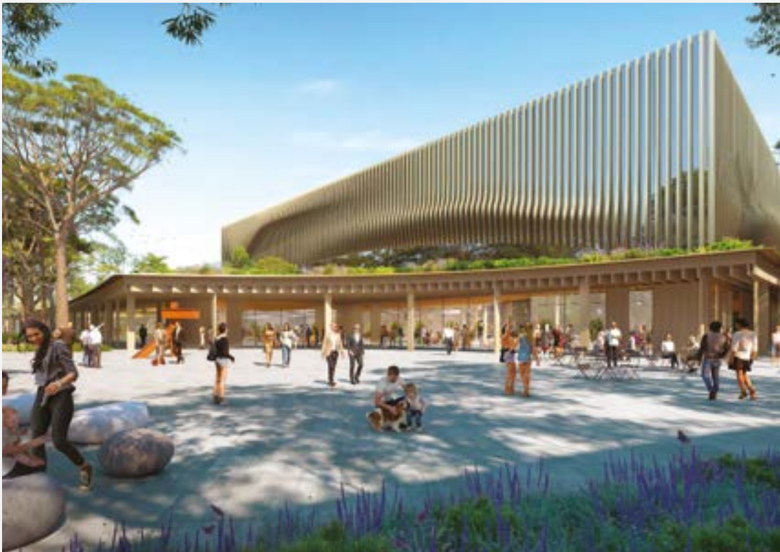
3rd prize: UNStudio (Netherlands), Schema4 (Greece), OKRA Landschapsarchitecten (Netherlands)