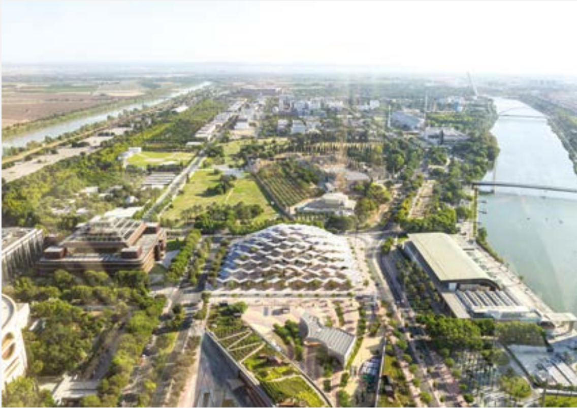
1st Prize: Bjarke Ingels Group (BIG), with team members Argenia Ingenier.a y Arquitectura (Spain), Buro Happold Limited (UK) and HCP Arquitectos y Urbanistas (Spain)