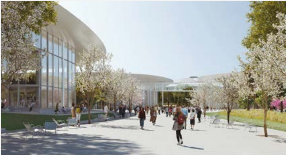
1st prize: Sauerbruch Hutton (Germany), Gustafson Porter + Bowman (United Kingdom) and Elena Stavropoulou (Greece).