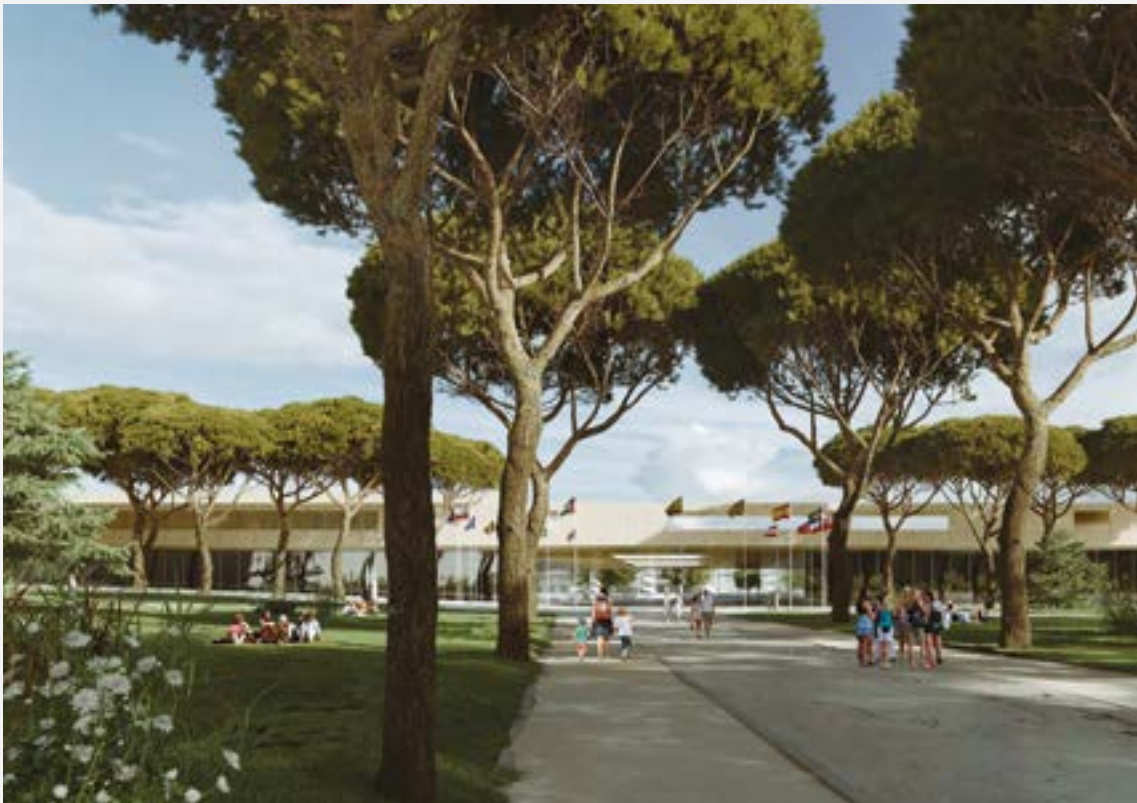
2nd prize: Lina Ghotmeh Architecture (France), Vogt Paysage + Urbanisme (France), LAN (France), LOT (Greece), Tractebel Engineering (France), Systematica (Italy)