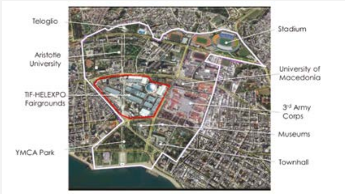
TIF-HELEXPO fairgrounds and the Direct Impact Zone