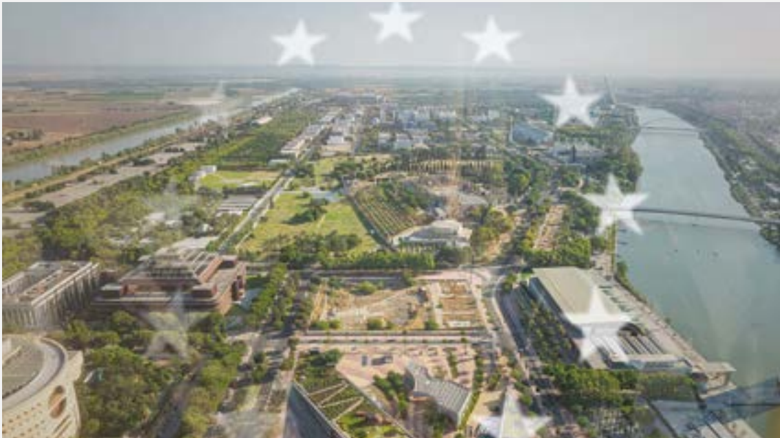
Competition site for the European Commission Joint Research Centre (JRC)