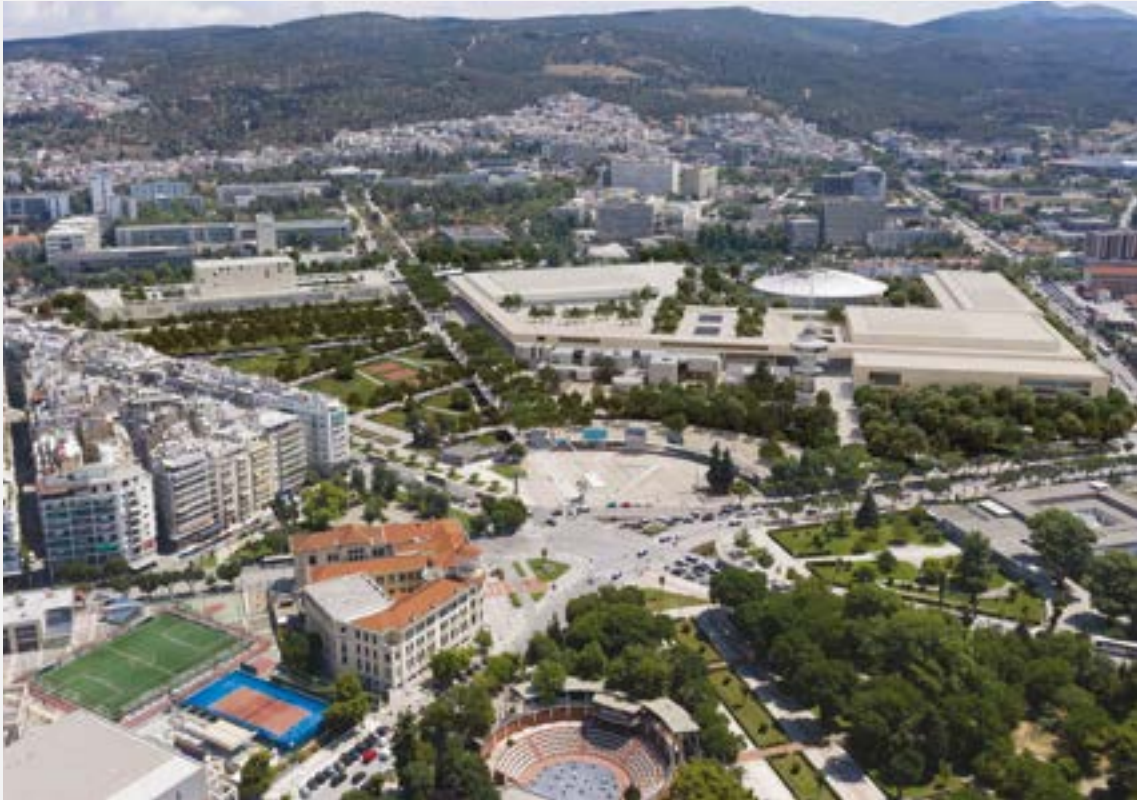
2nd prize: Lina Ghotmeh Architecture (France), Vogt Paysage + Urbanisme (France), LAN (France), LOT (Greece), Tractebel Engineering (France), Systematica (Italy)