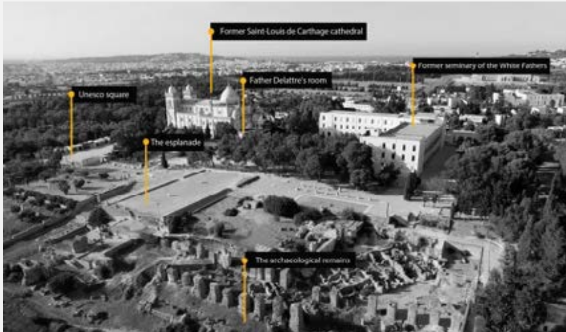
Requalification of Byrsa Acropolis and Rehabilitation of the Carthage National Museum Competition site