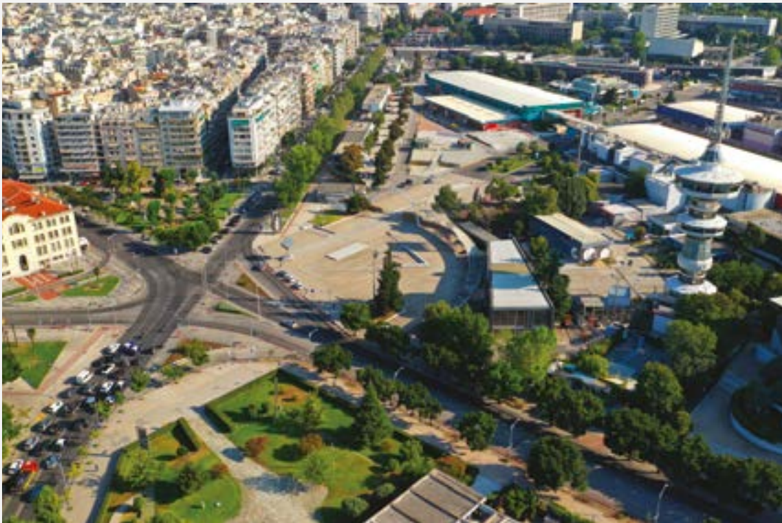
Competition site for the Thessaloniki ConfEx Park