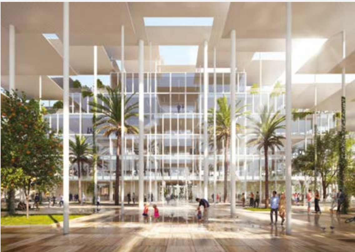
1st Prize: Bjarke Ingels Group (BIG), with team members Argenia Ingenier.a y Arquitectura (Spain), Buro Happold Limited (UK) and HCP Arquitectos y Urbanistas (Spain)