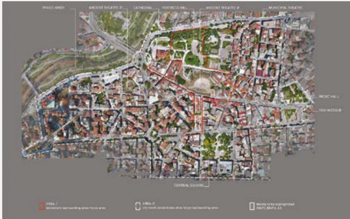
Surrounding Area of the Ancient Theatre A' of Larissa ideas competition (2022), Greece Competition site