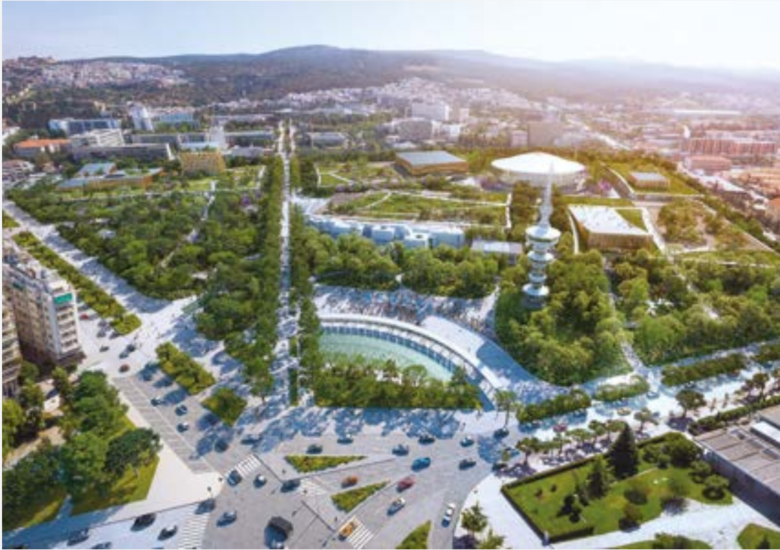
3rd prize: UNStudio (Netherlands), Schema4 (Greece), OKRA Landschapsarchitecten (Netherlands)